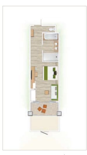
Superior Room / Superior Beachfront