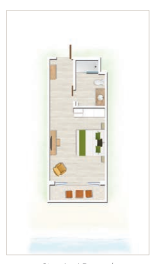
Standard Room / Standard Beachfront